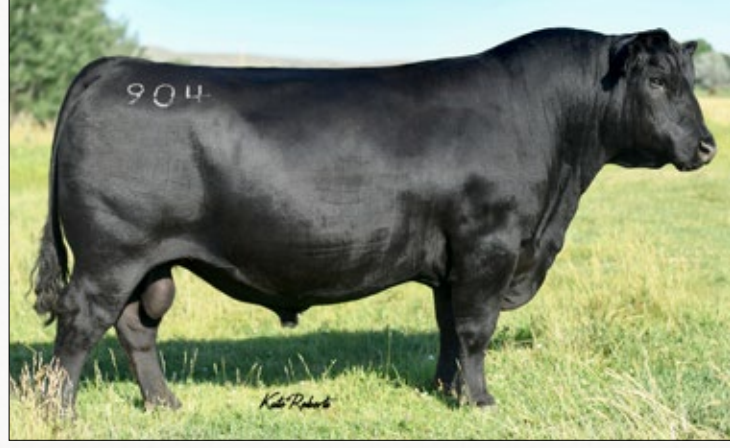
STERLING PACIFIC 904, NO.1 USA SIRE FOR MOST RECORDED PROGENY IN AUSTRALIA OVER THE PAST 2 YEARS.

STERLING PACIFIC continues to top bull sales across Australia and we are consistently getting outstanding reports from the first PACIFIC daughters that are starting to calve.