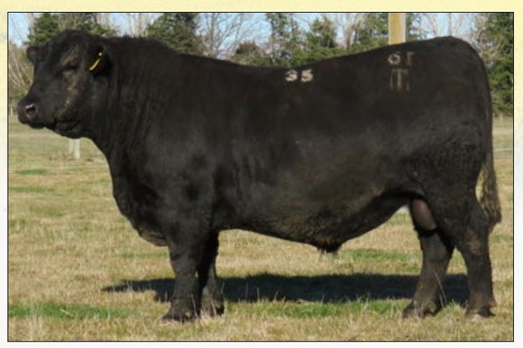
ALBERT OF STERN

ALBERT OF STERN, New Zealand's record-breaking sire has sold up to twenty-eight sons across Stern and Tangihau sales with a sale average of $28,000. Breeding very consistent deep ribbed, thick and very good-footed bulls that have dominated the 2024 sale season.